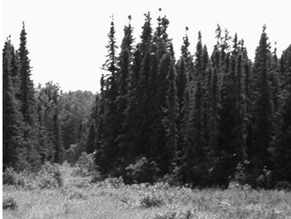
PLATE 1. Aspen (top) and spruce (bottom) are the dominant trees in the mixedwood boreal forest.

usually include a change in species composition. Multiple developmental pathways exist for mixedwood stands in mesic areas (Chen and Popadiouk 2002). The state of a stand is expressed from the interaction of stand condition, context, and disturbance history (Chen and Popadiouk 2002, Albani et al. 2005). Trembling aspen is the typical regenerating species in a stand when it is present in the pre-fire landscape (see Plate 1). This is a result of vegetative shoot development from root suckers. White spruce may establish at stand initiation depending on seed source, micro-site conditions, and interspecific competition (Greene et al. 2004, Albani et al. 2005; see Plate 1). White spruce is shade tolerant and will grow in the understory of aspen stands to be released to the overstory as aspen reaches maturity, dies, and provides gaps in the canopy. Through this pathway, stands may burn, regenerate along a successional trajectory with early deciduous dominance and lower probabilities of initiation, and then develop to spruce dominance and higher probabilities of initiation; a "fire-prone" white spruce can be seen as growing up in a protective aspen nursery. We must consider that initiation patterns (and fire re-